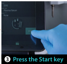
3 Press the Start key