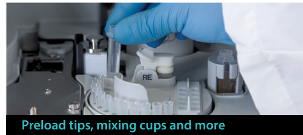
Preload tips, mixing cups and more