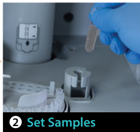
2 Set Samples