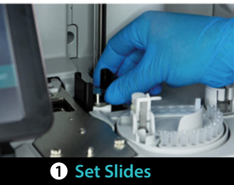
1 Set Slides